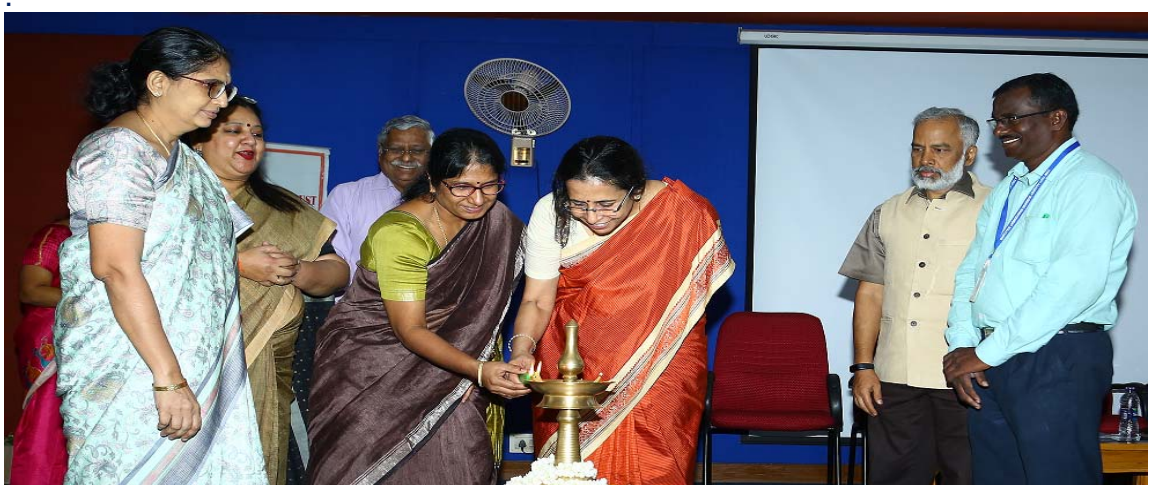
More than 150 delegates from Various Healthcare intuitions from Tamilnadu attended this daylong seminar.